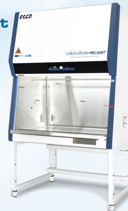
Model: LR2 G4