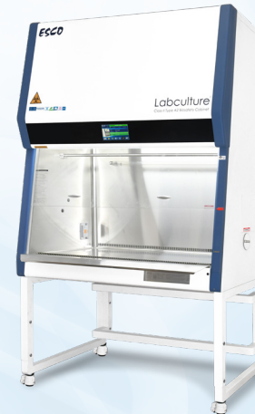
Model: LA2 G4