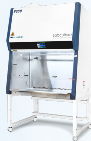
Model: LB2 G4