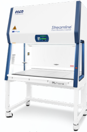
Model: SC2-E G4