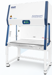
Model: AC2-E G4