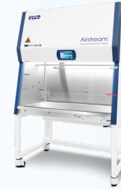
Model: AC2-NS G4